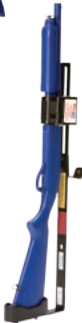
VERTICAL PARTITION MOUNT